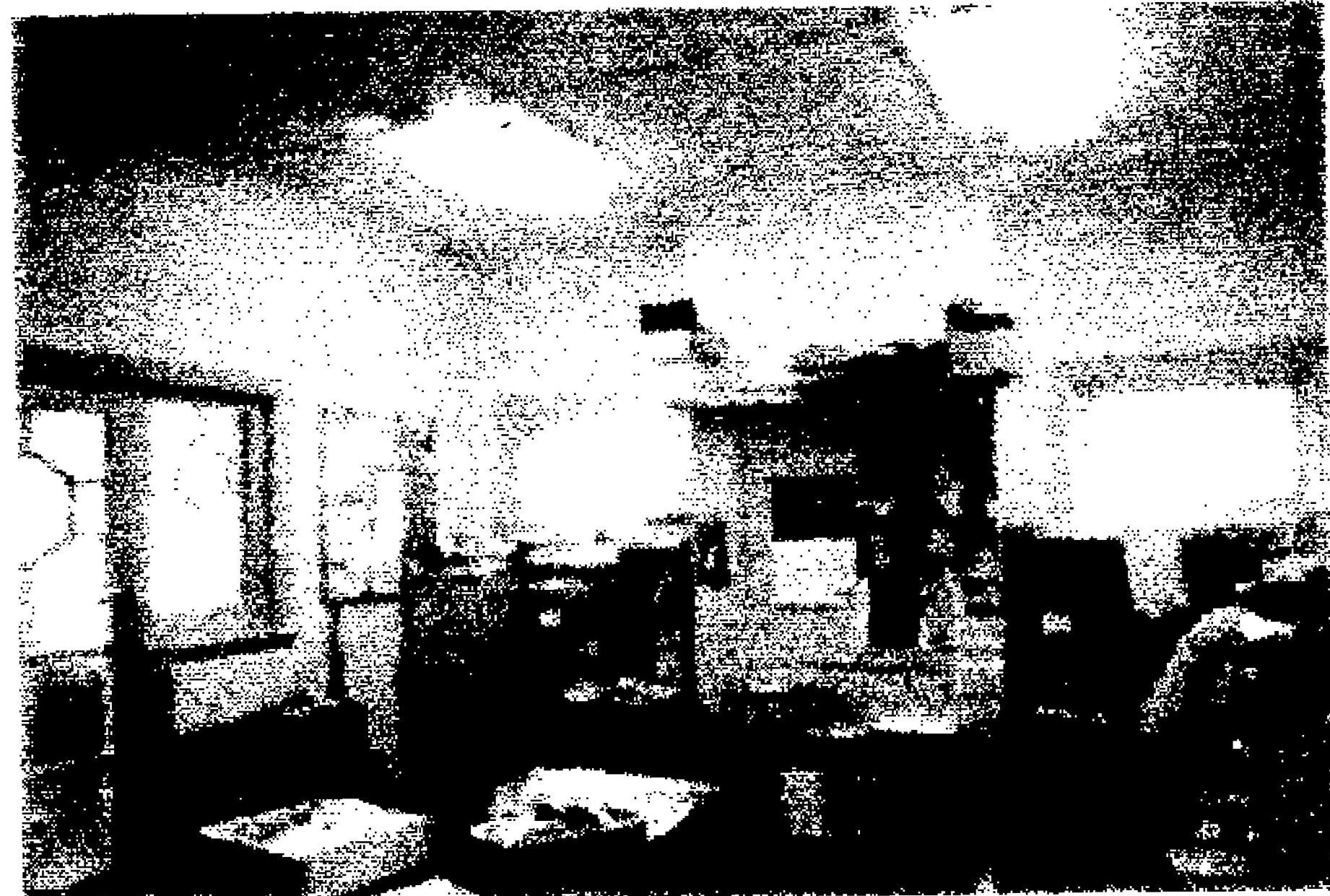
Staff room in the old school. Not sure but we think this might have been upstairs in Raewood (3 Ardoch Ave).

Alan Hollibone—9866 6167 (administration)