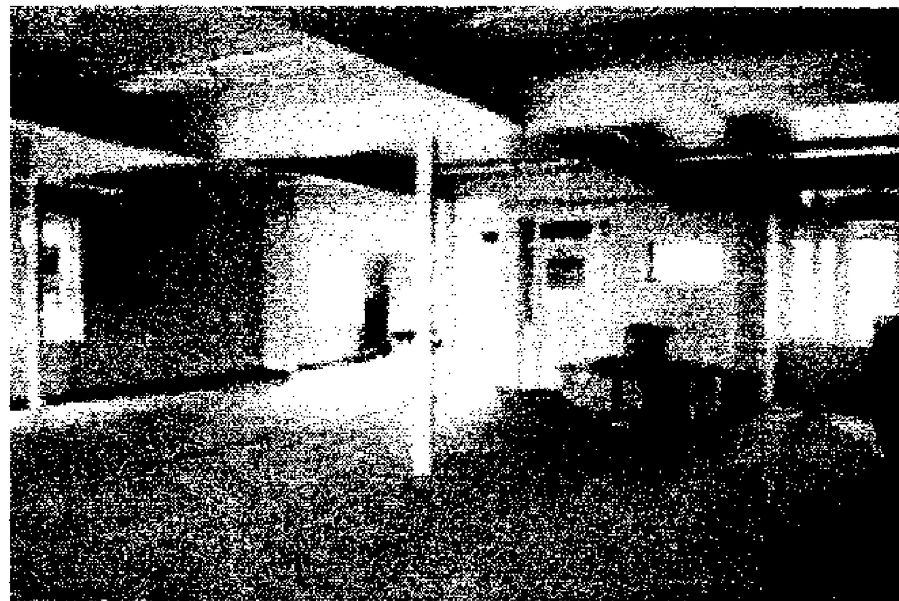
Magnolia used to be one big hall when it was a school in the 1980s ...