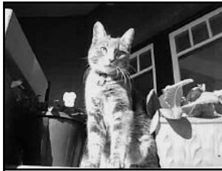
Ardoch's best known (and best fed) identity?

thority (EPA) legislation still covers excessive noise—of all types!