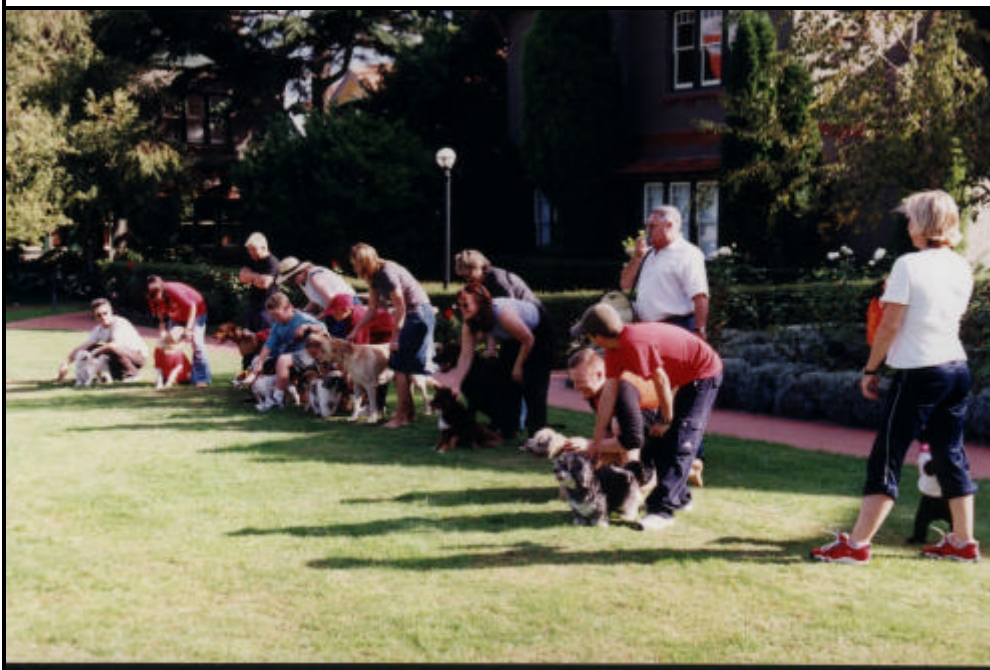
Ardoch pets get ready to vacate the Green?

Anyone interested in the full Regulations can view them on the internet at www.dms.dpc.vic.gov.au and follow the links through the Victorian Statute Book to regulation number 28/2001.